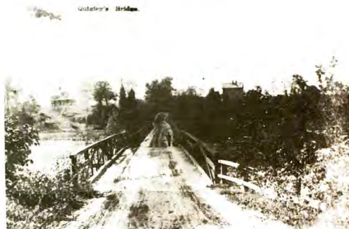
QUIGLEYS BRIDGE - The view is north on Hubbard Avenue. Man-made Shadow Lake is now on the left. The surrounding ground was formerly very marshy and the bridge was longer than the present span. The two houses are still there.

Foxwell opened for business in 1896. He conducted a studio photography business, but this article looks at the post card aspect of his work. The post card era years are approximately 1905-1915. The period was characterized by a high quality product with a wide-spread collector interest. It is extremely well-preserved pictorially due solely to the extensive picture taking of the post card publishers.