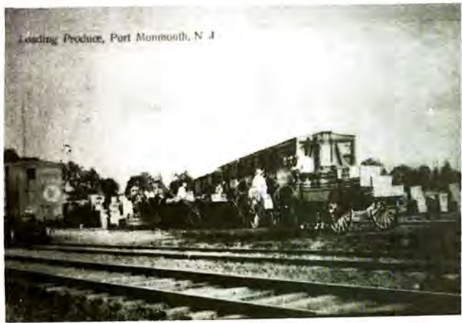
Local farms were productive and Pt Monmouth was an active outlet for markets.

The views of a New York Herald reporter combined condescension and insight into future mutual gain. At Port Monmouth, he referred to the locals as "favored people in this instance, by being aroused from a sort of lethargic state of stage coach and horse express inaction, to awake to the experience of a first class railroad". He realized "The farmers in that locality are to be the great gainers by the railroad institution and our own city in a great measure will soon feel its benefits".