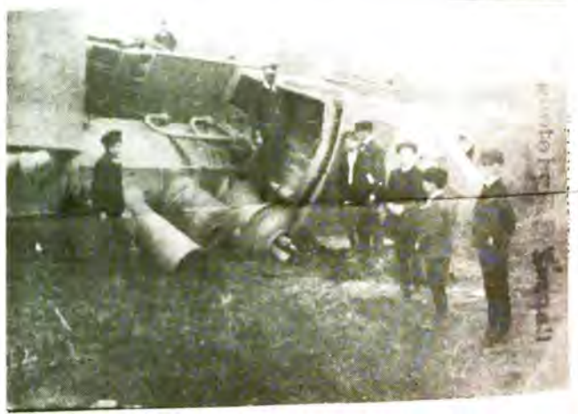
The Belford Wreck

Work progressed and the line was opened June 18, 1860. Two steamboats, the "Rip Van Winkle" and "Alice