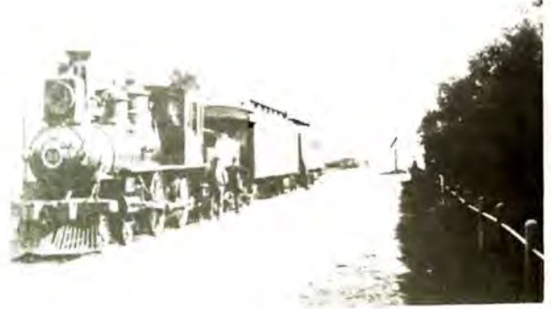
c.1890 R&DB train at Red Bank. Line then N.J. Southern

plan for a ferry over Delaware Bay, trackage to the Chesapeake Bay, a second ferry there and a direct route to the important southern port of Norfolk. Their actual intentions were quite different. Their road was built in a southwesterly direction to Atison in Burlington County, from where it proceeded in a northwesterly direction to Jackson in Camden County, where it connected with the Camden and Atlantic Railroad, placing Philadelphia in easy reach.