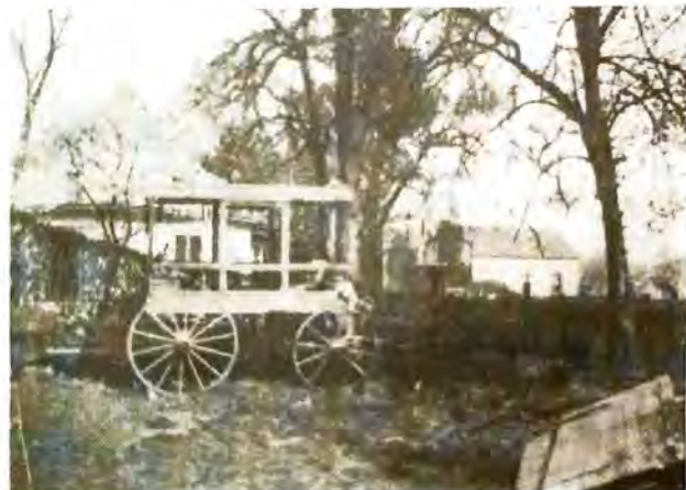
The stage served as a taxi in the early days of rail. This one was serving Navesink c.1890s & early 20th c.

The history of the railroad in Middletown differs from many other areas of the state, especially the northern suburbs. The first railroad in Middletown was a starting point for other destinations. On the next railroad, the present North Jersey Coast Line, Middletown was a less traveled station on the road to Long Branch and points south. Middletown station delivered more farm produce than passengers for many years. However, after housing replaced the farms, Middletown became one of the busiest stations on the line.