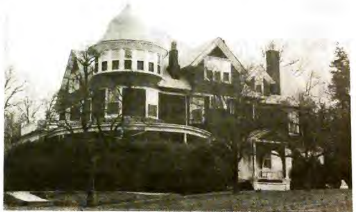
Figure 11. Serpentine Drive, Hillside