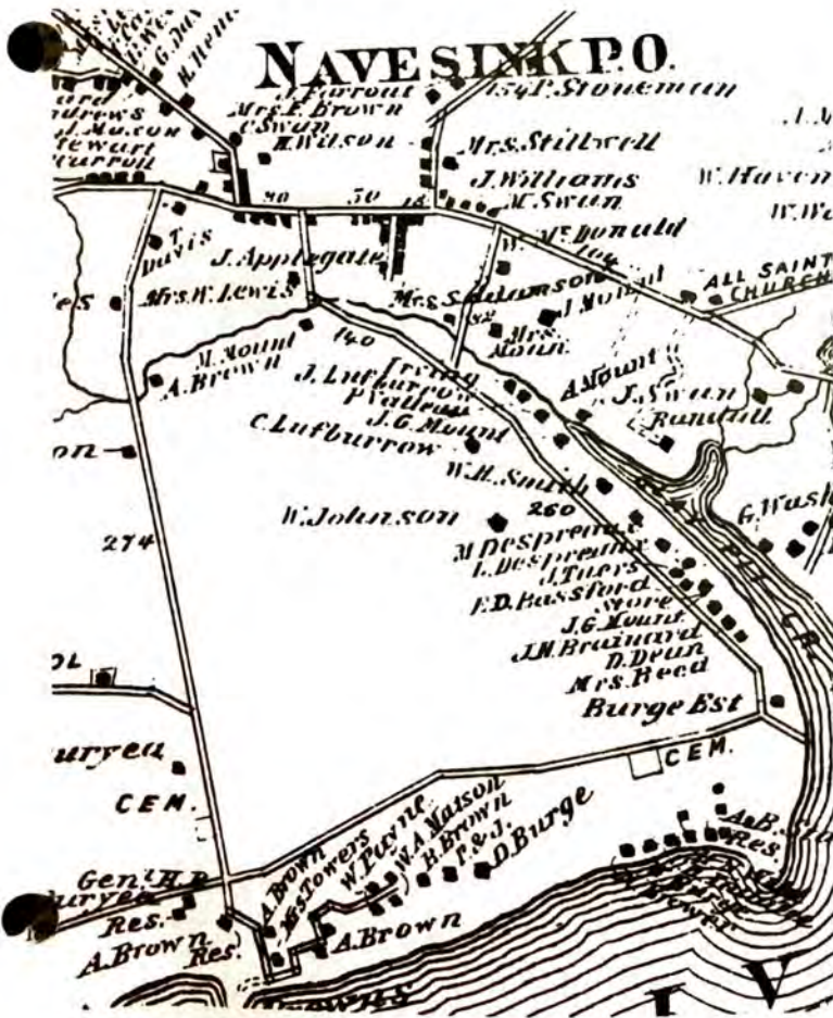
Figure 3. 1877 Beers Atlas, part of plate 53

Nehemiah built his house a year or two after his 1855 marriage. It stands at 920 Navesink River Road. The location is clearly marked on the 1877 and 1889 maps (Figures 3 and 4). The cemetery is the old Burdge burying ground. No trace of it is visible now to the roadside viewer.