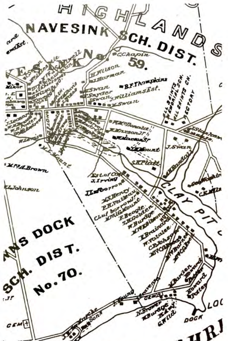
Figure 4. 1889 Wolvorton Atlas, part of plate 31.

Ten thousand dollars built an enormous house at the turn of the century. The house is a master craftsman's river front showpiece from an age of opulence.