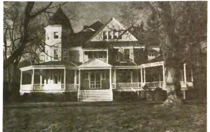
Figure 10. 458 Navesink River Road