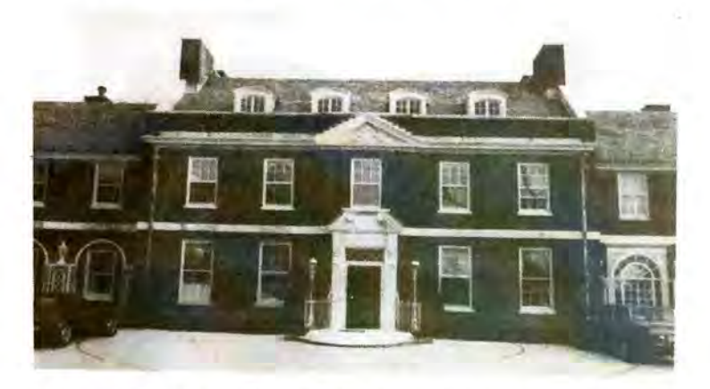
Figure 25. The Andrew Varick Stout house, Navesink River Road, Middletown.