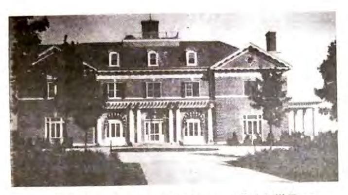
Figure 17. The J. Amory Haskell house at Oak Hill Farm.