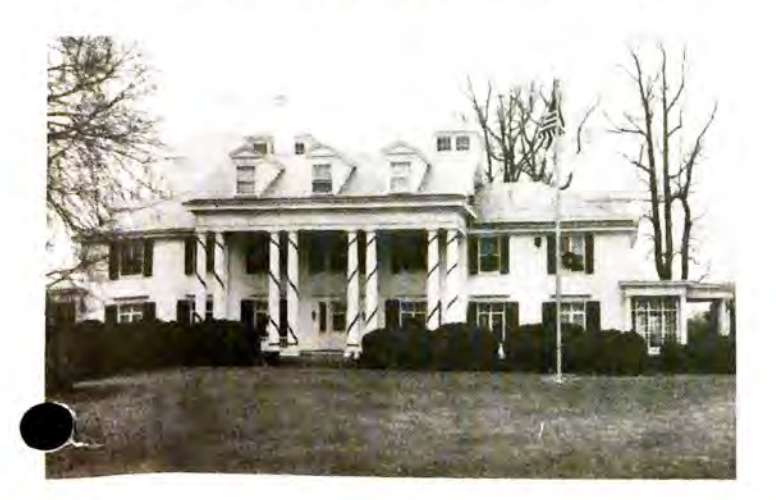
Figure 14. The William Payne Thompson house, now the Monmouth County Park System's headquarters in Thompson Park, Newman Springs Road, Lincroft.

The Country estate begun by J. Amory Haskell was the Township's largest and one of its finest. Some of the grounds are used as the site of the annual October Hunt Meet, but