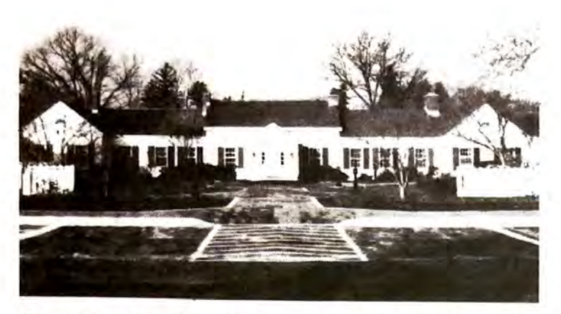
Figure 24. The Payne Thompson house is now Monmouth County Park System offices in Thompson Park.