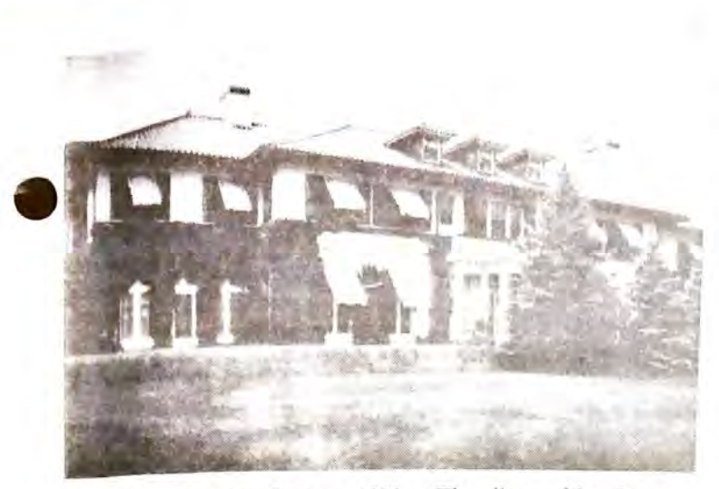
Figure 21. Blossom Cove, c. 1920s. The tile roof has been replaced with shingles.