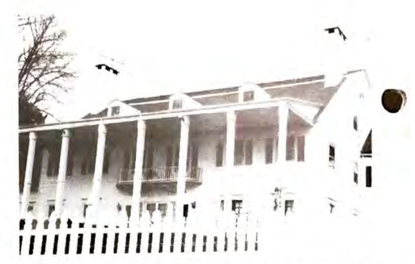
Figure 26. The Robert Collier house is now home of the Sisters of the Good Shepherd, Wickatunk, Marlboro.

Donations of historical materials: Please see a museum guide or write to the Society.