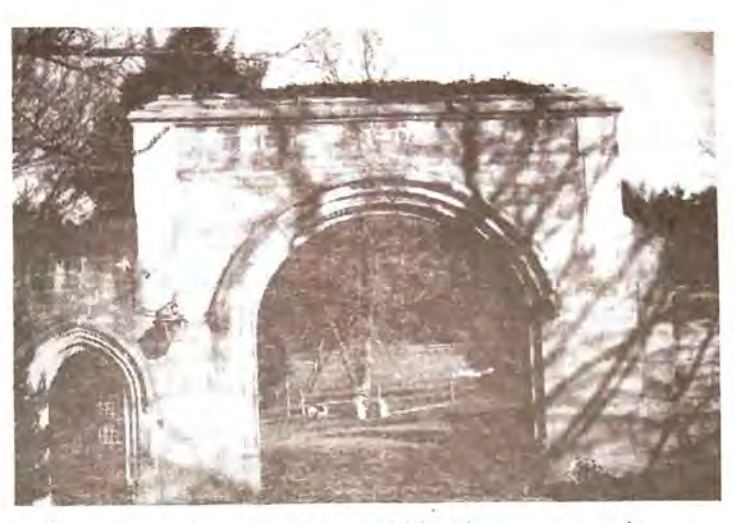
Figure 36. View west from Cobble Close court yard.

Mrs. Straus retained the property until 1949. The two farms, the main house and superintendents house were sold separately at auction that December 3. The horse and dairy