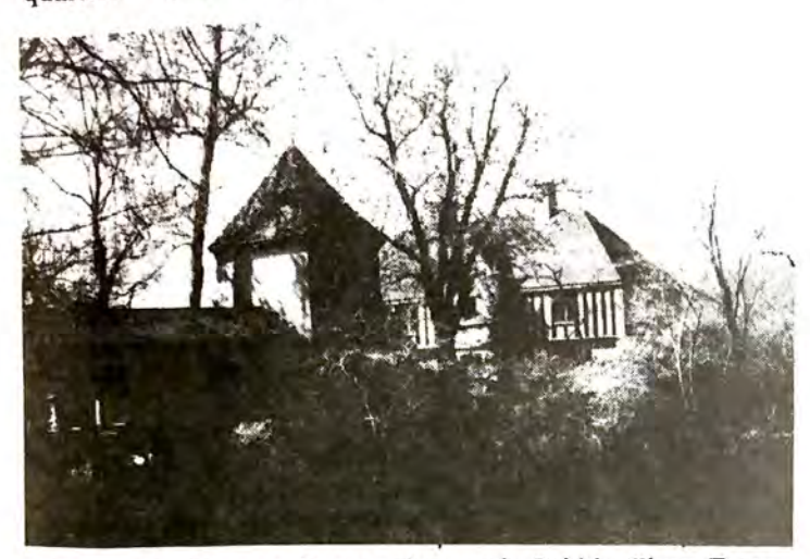
Figure 34. The arcade over the pond, Cobble Close Farm, Cooper Road, Middletown.

Hopkins group, the Cobble Close Farm. The design incorporated Southern French elements. A pond upon the site was seized upon as a dominating feature of the plan. Across one end of it had been built a dam upon which an Across one end of it had been built a dam upon which an arcade was erected. (Figure 34) Statuary is throughout. A arcade was designed by F. Burrall Hoffman, Jr., and and and scaped by Martha Brookes Hutcheson.<sup>23</sup> A favorite feature of the architect was the entrance to the mens' quarters.<sup>24</sup> (Figure 35) The complex is now