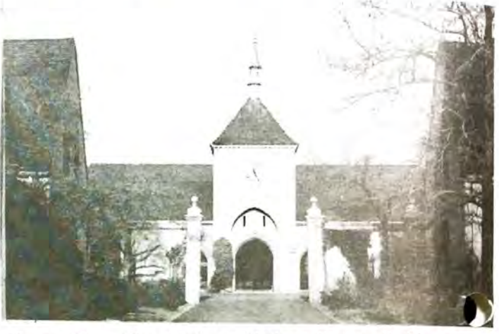
Figure 32. The Herbert Nathan Straus Stable group, Middletown.

Detailing and finishings were the finest quality in every respect. Construction was overseen by Mrs. Straus, whose demandingness and skillful eyes were satisfied by nothing less than perfection. A square clock tower over a courtyard dominates the entrance from the south. A structure with a round tower reflects a key Norman design element. (Figure 33) The group is now a private residence.