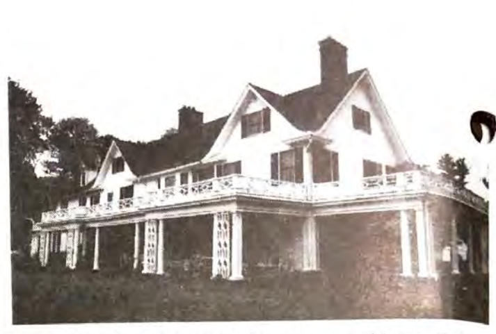
Figure 31. The Herbert Nathan Straus residence, Cooper Road, Middletown.

The stable buildings were built north of the main house, an exquisite example of French Norman style. (Figure 32)