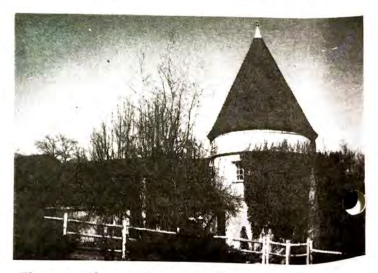
Figure 33. Tower, H.N. Straus stable group, Middletown.

The Strauses had long kept a dairy in older farm buildings. They replaced them in 1931 with the second