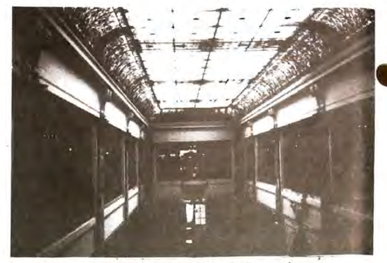
Figure 39. Main hall, the Hubert T. Parson house.

Its bid, the only one, was a token $100. The age of splendor was over ^{26}