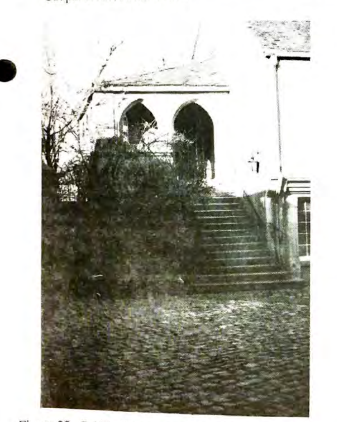
Figure 35. Cobble Close, entrance to the mens quarters.

condominiumized residences. Architectural integrity is largely intact, a few modern intrusions notwithstanding. The view from the rear of the courtyard is the same as the Strauses enjoyed sixty years ago. (Figure 36)