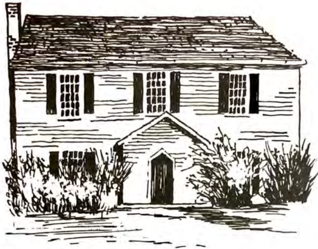
Figure 7. The Chapel (Destroyed)