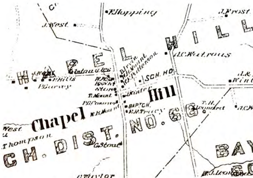
Figure 1. 1889 Wolverton Atlas, part of plate 30