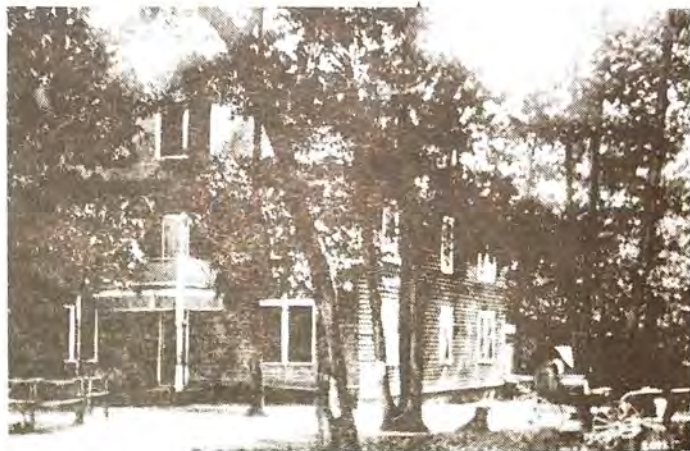
Figure 5, 6. Eunice Home (Destroyed)