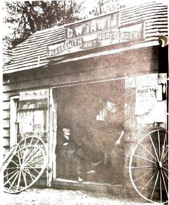
Figures 2, 3. Daniel W. Irwin

Chapel Hill is much changed since then and it probably is no longer recognizable to the passerby as a former village. Chapel Hill is centered on Kings Highway East between Chapel Hill Road and Stillwell Road. It can be approached from four directions, but two travel patterns changed since Comstock's time. She urged readers arriving via Leonardo to proceed south on Chapel Hill Road. This route is now blocked by the Chapel Hill section of the Earle Naval Weapons Station. One wonders how Chapel Hill may have changed if there were no Earle and the many lot owners, initially concentrated near Leonardville Road spread