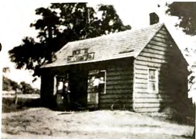
Figure 4. Chapel Hill Blacksmith Shop (Destroyed)