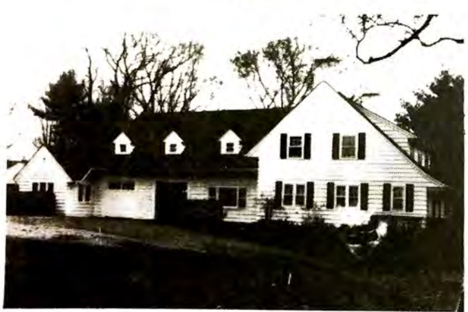
Garage as residence