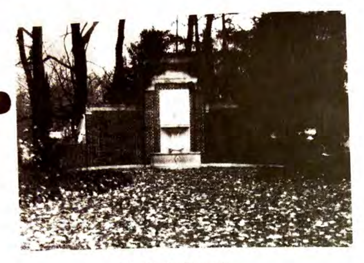
The Garden Fountain

the living room on the east of the main block, the library in the east wing, and a dining room in the west front of the hall. A butler's pantry was behind the dining room while a kitchen and servant's hall were in the west wing. The plan was published in the November 1912 number of Architecture . The dimensions were 125 feet by 42 feet.