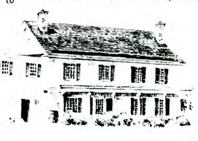
Image of the Seabrook-Wilson House by Irwin J. Kappes, 1985 Middletown Township Historical Society collection

Our meeting at the Seabrook-Wilson House was indeed special considering the house is currently closed for construction, and had previously been open only for limited Park System programs due to its condition. The grounds are open for the public's use.