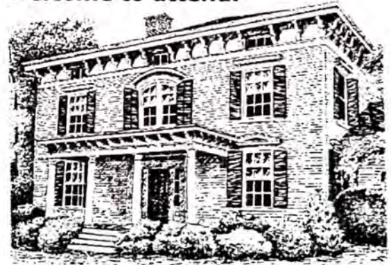
Image of the Taylor-Butler House

The Nov. 15th meeting will be held at the Taylor-Butler House (127 Kings Hwy, Middletown) We will tour the house and talk about its history. Meet at Taylor-Butler, 7:30 p.m. Parking is at the Middletown Village Elementary School. All are welcome to attend.