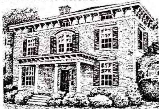
Image of the Taylor-Butler House

The Nov. 15th meeting will be held at the Taylor-Butler House (127 Kings Hwy, Middletown) We will tour the house and talk about its history. Meet at Taylor-Butler, 7:30 p.m. Parking is at the Middletown Village Elementary School. All are welcome to attend.